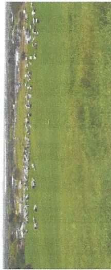
VIEW OF GROUNDS FROM MOUNT SUGARLOAF

The Camperdown Showgrounds is an area of 8.4 hectares that is owned and managed by the Camperdown Pastoral & Agricultural Society for the community to use and enjoy.